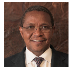
H.E. Jakaya Kikwete Alternate Co-Chair Former President of the United Republic of Tanzania