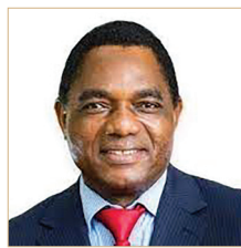
H.E. Hakainde Hichilema President of the Republic of Zambia (Event Host)