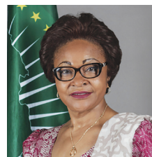
H.E. Amb. Josefa Sacko African Union Commissioner: Rural Economy and Agriculture