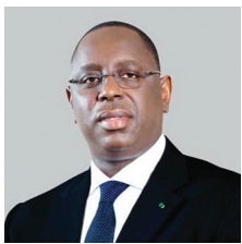
H.E. Macky Sall Co-Chair President of the Republic of Senegal Chair: African Union