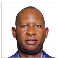
Hon. Mike Mposha Minister: Water Development and Sanitation, Zambia