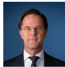
H.E. Mark Rutte Co-Chair Prime Minister of the Netherlands