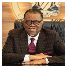
H.E. Hage Geingob Co-Chair President of the Republic of Namibia