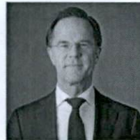
H.E. Mark Rutte Co-Chair Prime Minister of the Netherlands