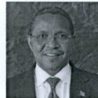
H.E. Jakaya Kikwete Alternate Co-Chair Former President of the United Republic of Tanzania