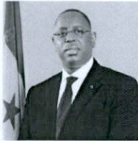
H.E. Macky Sall Co-Chair President of the Republic of Senegal Chair: African Union